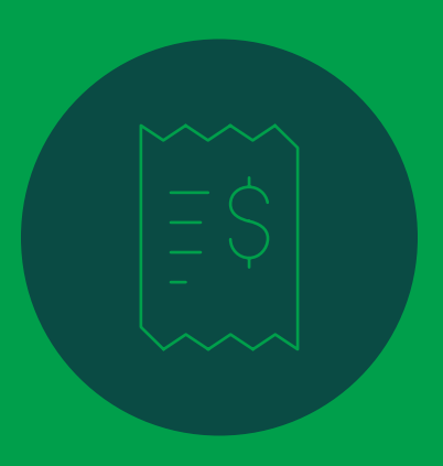
Save your receipts