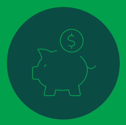
Make tax-free deposits