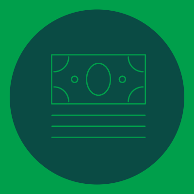
Contribute as much, and as often, as possible (up to the contribution limit)